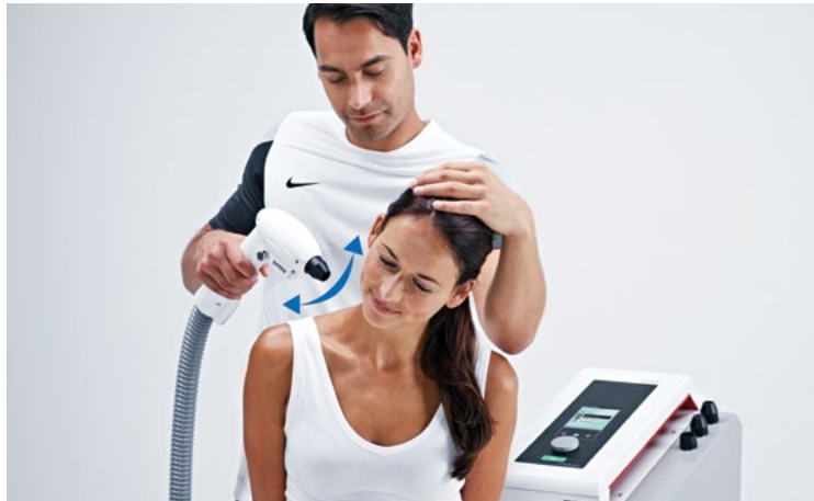
Dynamic treatment method

THE GYMNA CRYOFLOW ICE-CT IS EQUIPPED WITH INTELLIGENT SOLUTIONS FOR YOUR COMFORT: