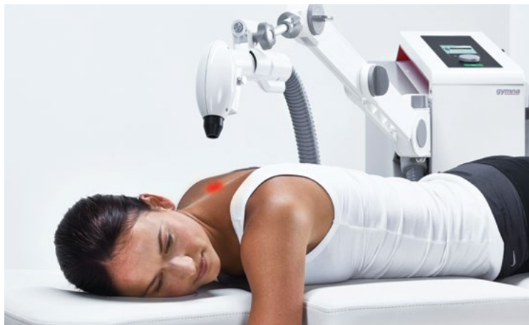
Static treatment method

2 treatment methods: static and handsfree or dynamic and manual